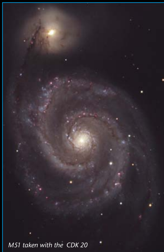
M51 taken with the CDK 20

Both of the simulations take into consideration a flat field, which is a more accurate representation of how the optics would perform on a flat CCD camera chip. For visual use some amount of field curvature would be allowed since the eye is able to compensate for a curved field. The diffraction simulation was calculated at 585nm. The spot diagram was calculated at 720, 585, and 430nm. Many companies show spot diagrams in only one wavelength, however to evaluate chromatic performance multiple wavelengths are required.